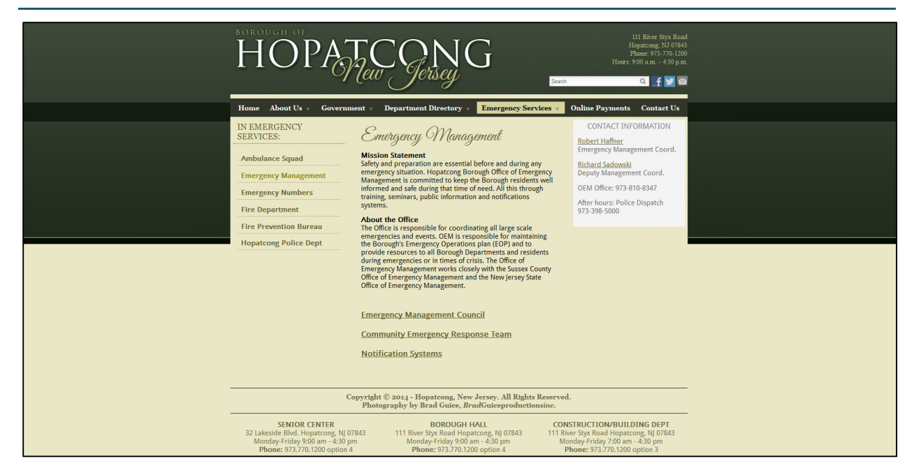
Figure 9.13-1. Screenshot of Borough Website with Examples of their Emergency Information Notification

The Borough's website's home page posts information regarding upcoming community events and important municipal decisions. The Borough's website also includes an emergency management information webpage.